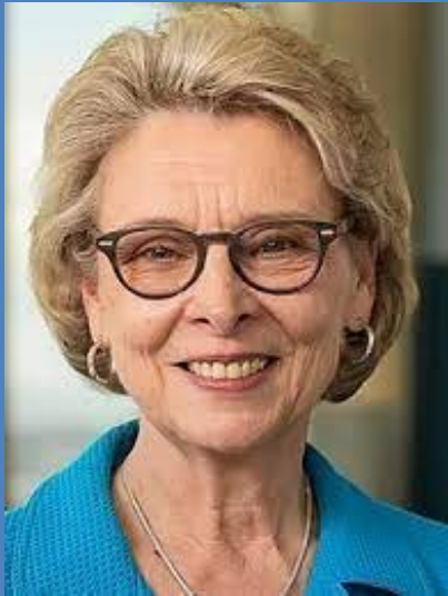
Former Gov. Christine Gregoire